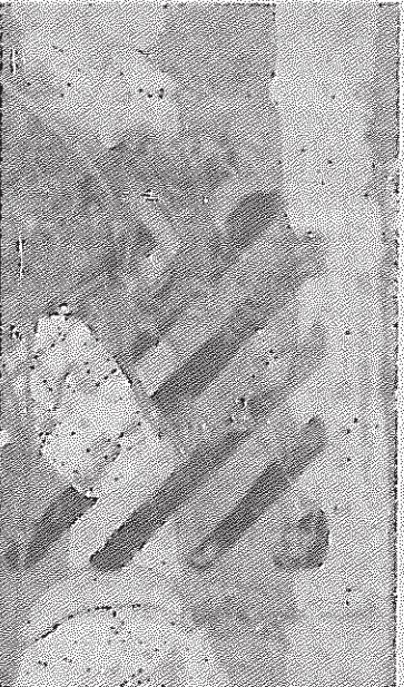
'The seal of line marking remained unbroken from 2006 to 2008, before this grating was lifted to unblock the gully. In spite of appearances, silt rather than debris, seems to be the predominant cause of blockages. This photograph was taken in September, 2007.'