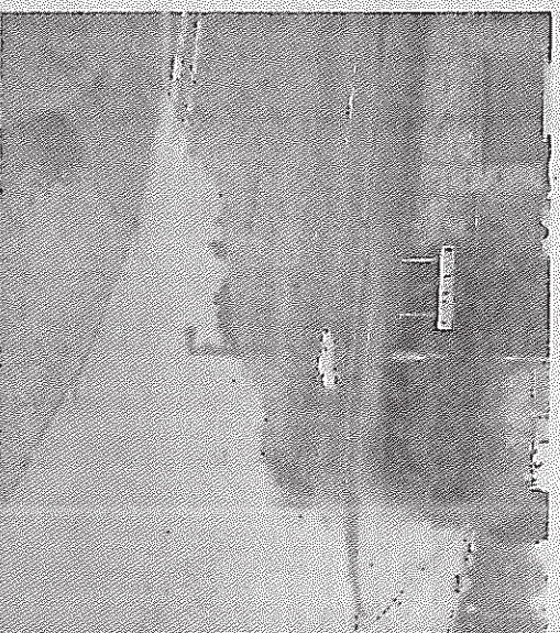
Martin Hodson Forest Road Loughborough

"Beneath the puddle there is a blocked gully. It was reported blocked in October 2011 and not emptied until March 2013.